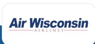
Air Wisconsin Airlines