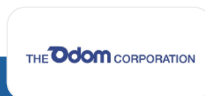
The Odom Corporation